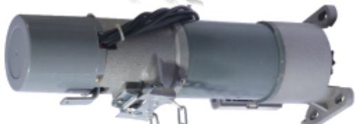
RSO5R and RSO5R3P