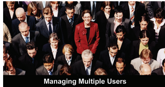
Managing Multiple Users